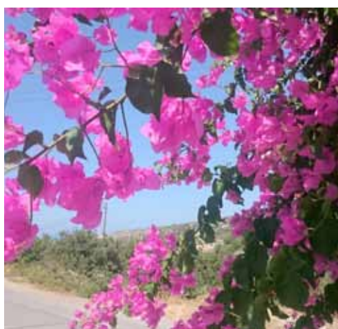
Oleander is a native plant of Crete

vibrant wild flowers, goats - which love eating fig leaves - and amazing views, it really is nature at its best.