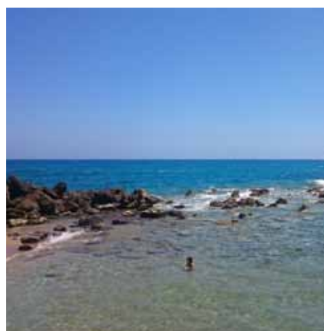
Beach on the north coast of Crete

■ Jet2.com providing friendly, punctual and comfortable flights.