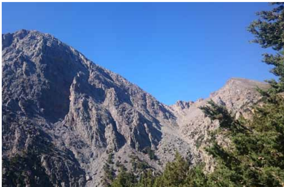
The White Mountains in Crete, as seen from the top of the Samaria Gorge.

With olive, fig and orange trees, a plethora of herbs,