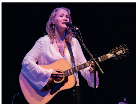
figure. I understand that I don't have to like every one of his songs to be a fan.

“A song desires to be sung, no matter who wrote it”